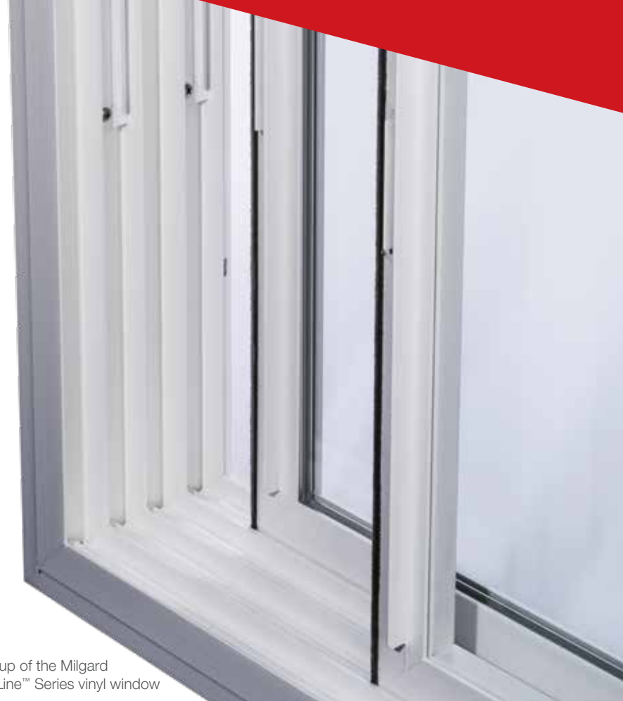
Close-up of the Milgard Quiet Line™ Series vinyl window

Usually when sound control is the focus a specific STC requirement is the target. Using our STC rating chart, identify the noise sources you most frequently hear in your home, then choose the type of window necessary to reduce those noise types. Consult a Milgard Dealer for more information on the window type best suited for your particular needs. It's that easy.